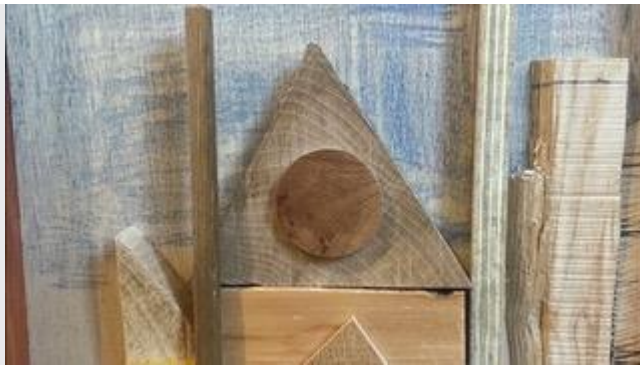
Celebration: A song for Creationtide youtube.com

Here is the link to the video on YouTube. Please share.